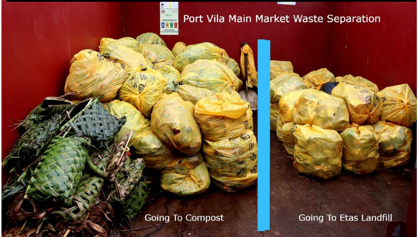
Going To Compost