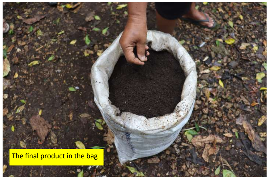
The final product in the bag