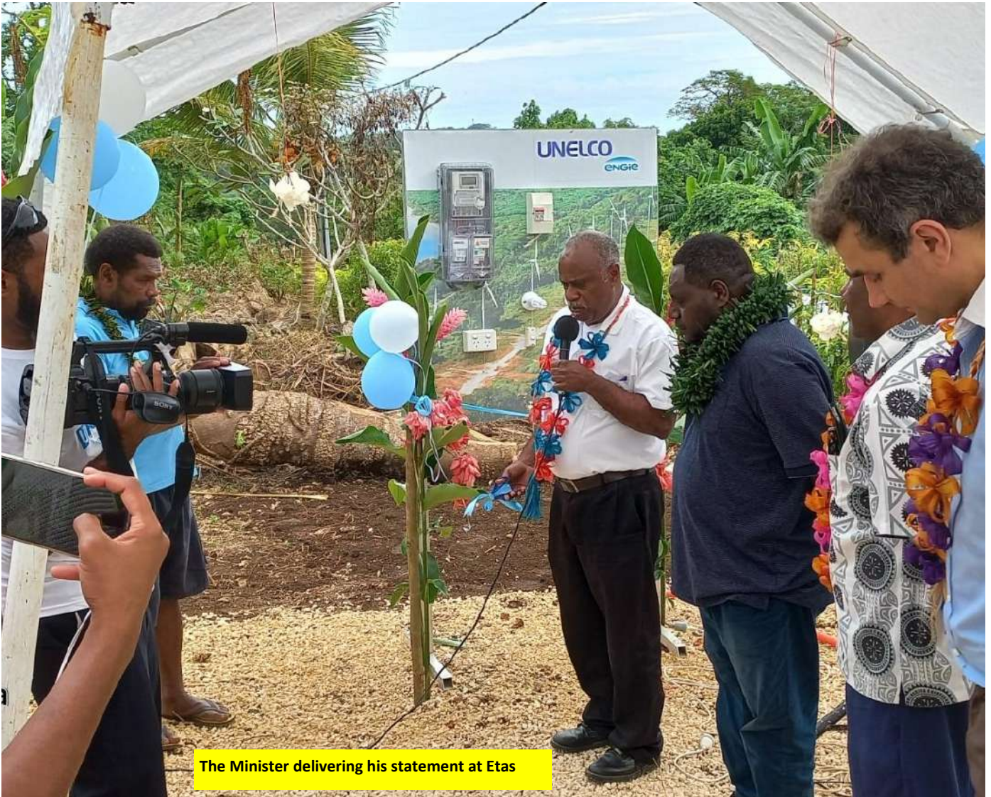
The Minister delivering his statement at Etas